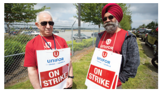
Unifor members on the picket line during the Cascade Aerospace strike in 2014.

Quebec's anti-scabs laws effectively ban the use of any employee or contracted workers to perform the duties of a bargaining unit member, except for managers at the workplace, rendering it the most favourable to workers in the country. However, the loophole which allows managers to be deployed as scabs has been exploited by some employers to drag out disputes. This undoubtedly contributed to one of the longest labour disputes in Quebec's history, when Delastek deployed managerial scabs to hold out against Unifor Local 1209, leading to a 35-month strike from 2015 to 2018. Likewise, workers at the ABI aluminum smelter in Bécancour, QC were locked out for 18 months from 2018 to 2019 by their employer with the help of scabs and the authorities' failure to properly enforce anti-scab provisions. Ontario's anti-scab legislation, now repealed, permitted the use of managers and non-bargaining unit employees as scabs, that (while limited) created an even more expansive pathway to potential disruptive labour relations during a dispute. Finally, B.C. laws - which allow all employees at the workplace to cross picket lines during a dispute - are the weakest of the three.