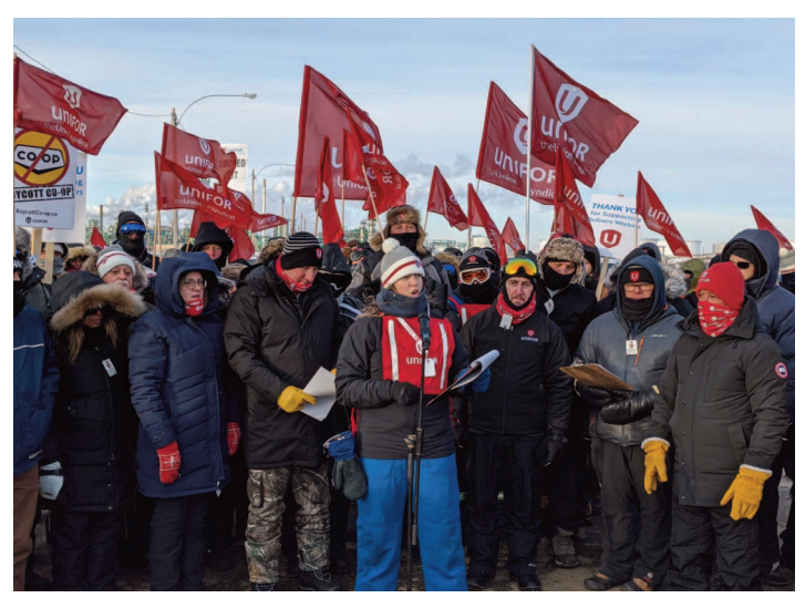
Unifor members from across Canada helped to bolster the picket lines at the Co-op Refinery lock-out.

So many families were impacted by this, freezing out on the picket line and looking up and seeing that helicopter. It was awful from the first day we saw those helicopters fly in. Watching them continue to fly in all day, every day. They would make low passes, I'm sure intentionally just for the psychological impact it would have on all of us. And the flight paths took them around the city, making sure that a massive percentage of the membership and everyone else in Regina was very aware of the helicopters and what was going on.