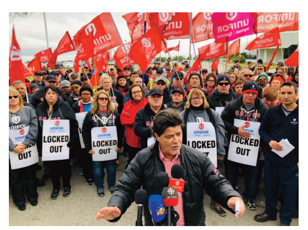
Jerry Dias tells locked out D-J Composite workers scabs are not crossing a Unifor picket line again.

At our National Convention in August 2019, more than a thousand Unifor delegates endorsed a resolution to undertake a national campaign to fight for anti-scab legislation in Canada. This resolution was proposed by Unifor Local 597, whose members working at DJ Composites in Gander, NL were locked out for 740 days – the second longest labour dispute in Unifor's history. As noted above, the three longest disputes in Unifor's history involved the use of scabs, a fact that speaks for itself when considering what effect scabs can have on the duration of labour disputes, and on the overall state of labour relations between workers and their employers.