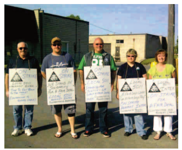
Members across Ontario at Intek Communications and DHT were locked out for 457 days in 2012.

Although empirical studies are important to get a sense of whether there are any discernable effects of antiscab legislation on aggregate statistics such as the number and duration of labour disputes, the studies cited above suffer from a number of issues that limit our ability to draw meaningful conclusions about the importance of anti-scab legislation. For one, their sample size is often limited to a small number of jurisdictions and disputes involving large bargaining units (typically more than 500 members), which means that they are drawing on a relatively small pool of data that is subject to a large number of external variables which might be causing the observed effects.