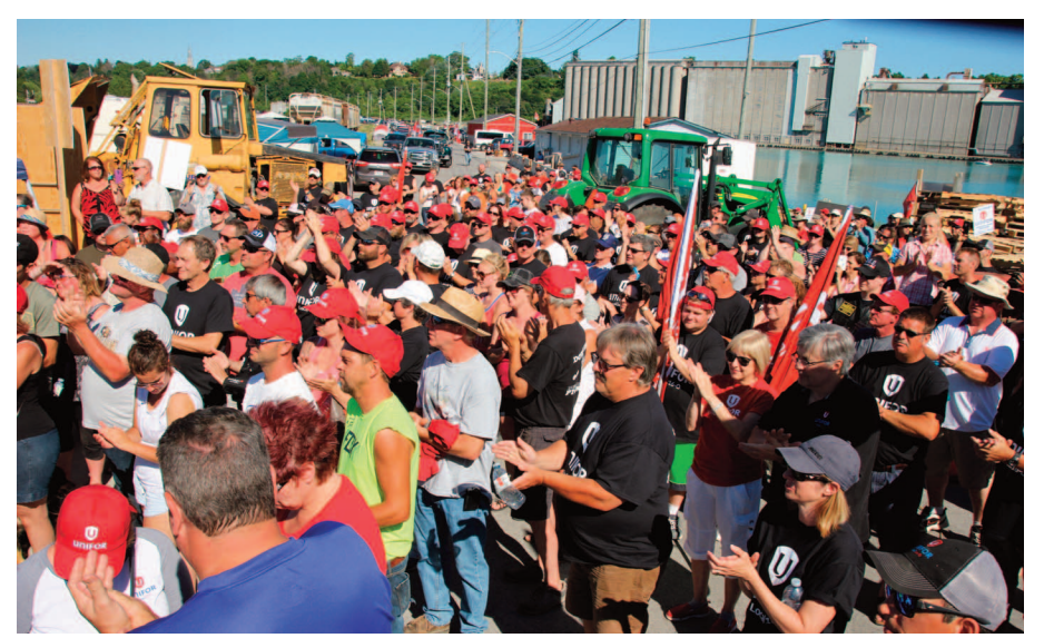
Hundreds of Unifor members traveled to a rally in support of workers at the salt mine in Goderich in 2018.

people, and still getting their product out, it's absolutely tipping the balance and the scales in the company's favour.