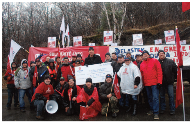
Presentation of a donation to the striking members of Local 1209 at Delastek at a solidarity demonstration in the streets of Grand-Mère, Quebec, on December 15, 2015.

We also know that beyond the numbers themselves, there are real working people out on the picket line, taking huge risks and fighting for themselves and their families. In Voices from the Picket Line , we are going to look at two real life case studies that document the experiences of Unifor members and how the use of scabs during labour disputes undermined workplace safety, increased the likelihood of conflict, dragged out disputes, and created lasting animosity that destabilizes labour relations.