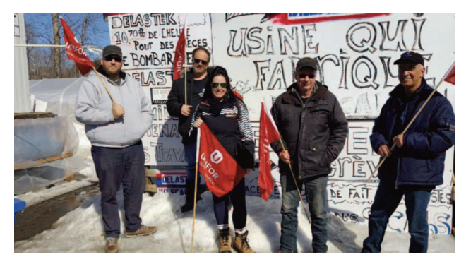
Unifor members in Grand Mere, Quebec spent 1074 days on the picket line.

In Canada, three provinces currently have or have had anti-scab legislation: Quebec, British Columbia and Ontario.