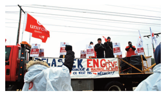
Speech by Jerry Dias at a solidarity event for Local 1209 members at Delastek on December 15, 2015.

All three provincial anti-scab laws made exceptions in the case of emergencies where health and safety are at risk or there is the risk of damage to property, machinery or the environment.