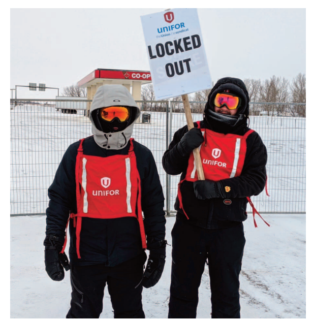
Members of Unifor Local 594 were forced to endure a longer lock-out in frigid conditions thanks to replacement workers.

The use of scabs tips the balance of power, and it really left us without many options. Local 594 is supposed to be their sole provider of labour. But with us locked out and their ability to replace us with replacement workers, it really took away the only leverage that we had. So we were kind of trapped out on the line. The company was not willing to bargain because they didn't feel any need to do that, as they were able to run the plant with their scabs and without us.