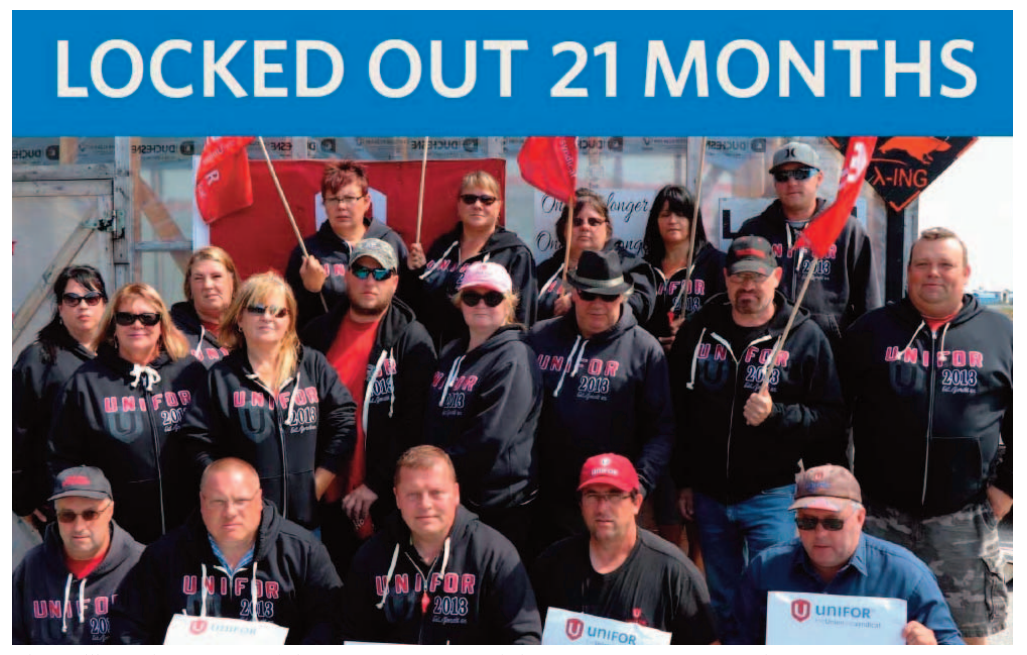
This Billboard was part of the campaign to end the D-J Composites Lockout.

studies, there was a significant and substantial reduction in the length of the work stoppages . Of all the variables they examined, including dues check-off, compulsory conciliation and mandatory strike votes, among others anti-scab legislation, along with bans on professional strike-breakers and reinstatement rights, had the most significant impact on the length of work stoppages, considerably reducing them. Notably, the authors also found that there was little to no evidence that there was any effect on days lost to work stoppages once anti-scab legislation was introduced, both in the first two years following its implementation and after it had been in effect for more than two years.