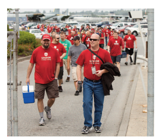
Unifor members walk off the job on day 1 of the strike at Cascade Aerospace in Abbotsford, B.C.

Section 68 (1993) of British Columbia's Labour Relations Code prohibits employers from using scabs who are new hires (i.e. after notice to commence collective bargaining has been given), employees who ordinarily work at another place of operations or who have been recently transferred, or externally contracted workers. Unlike in Quebec, B.C. anti-scab rules permit an employer to use scabs when they are existing members of the bargaining unit or they are employees, working in the establishment and hired prior to the commencement of collective bargaining (e.g. managers). The only restriction is that employers cannot compel or coerce an employee into performing any or all of the work of a bargaining member unit while on strike or lockout.<sup>2</sup>