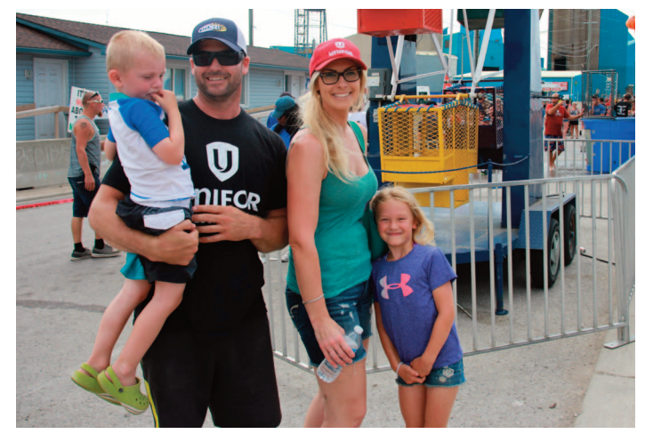
One of many families featured in a series of videos about how scabs hurt families posted during the Compass Minerals dispute.

Only about 2.1% of Unifor's contract negotiations since 2013 have involved a strike or lockout, and employers used scabs in less than 10% of those disputes. However, it is clear that when they are involved, scabs make strikes and lockouts longer, more acrimonious, and more risky in terms of workplace health and safety. The employers' ability to use scabs tips the balance of power too far in their favour and undermines normalized labour relations. It is time to level the playing field and pass anti-scab legislation, allowing working Canadians to bargain fair contracts that support themselves, their families and their communities.