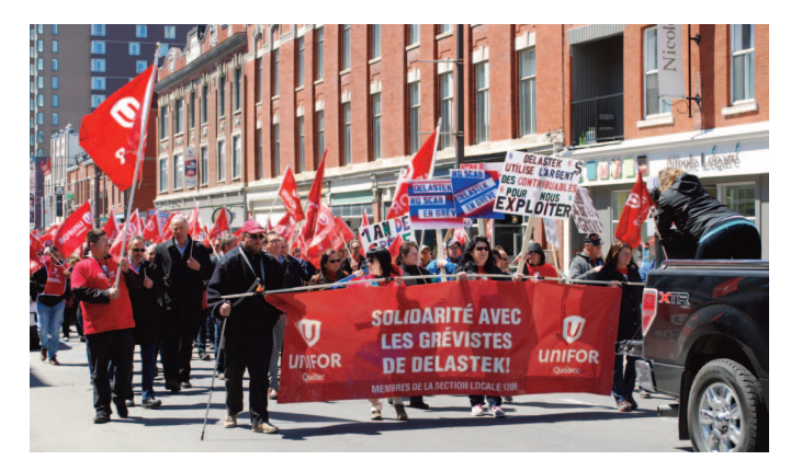
Walk in solidarity with the members of Local 1209 at Delastek in the streets of Trois-Rivières during Quebec Council on May 5, 2016.

In Spain, labour statutes do not regulate the use of replacement workers. Rather, the prohibition of scabs is by royal decree. This dates back to 1977 (RDL 17-1977, Article 6), wherein the decree specifies that, "As long as the strike lasts, the employer may not replace the strikers with workers